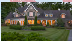
2141 Frank Brenneman Northern Home $1,487,000 - Nov 2017