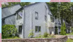
26 Arrowhead Lane Lakefront Condo $360,700 - Oct 2017