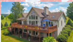
308 Moorings Way Lakefront Home $991,000 - Dec 2017