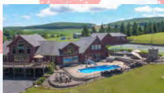
1391 Turkey Neck Rd Lakefront Home $1,050,000 - Nov 2017