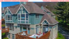
1278 Deep Creek Dr #1B Lake Area Condo $310,000 - Oct 2017