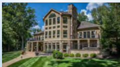
870 Reserve Drive Lakefront Home $1,725,000 - Nov 2017