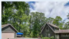
269 Heron Cove West Lakefront Home $730,000 - Oct 2017