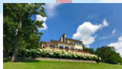
43 Overlook Terrace Lake Access Home $770,000 - Oct 2017