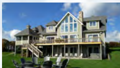
108 Lake Front Links Lakefront Home $975,000 - Nov 2017