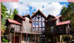
1992 Paradise Point Lakefront Home $1,550,000 - Dec 2017