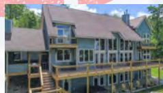
185 Parkside North Ct Wisp Ski Home $860,000 - Jan 2018