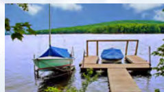
3151 Turkey Neck Rd Lakefront Home $835,000 - Dec 2017