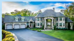
585 Glendale Road Lakefront Home $2,500,000 - Oct 2017