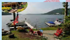
1383 Rock Lodge Road Lakefront Home $826,000 - Oct 2017