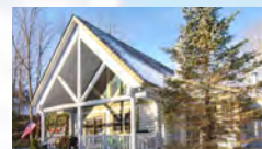
65 Village Drive #6 Lake Area Home $338,500 - Mar 2018

For a complete, updated list of all our sold listings, please visit www.railey.com/sold-properties .