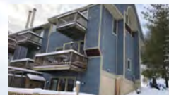
80 Bright Passage #80 Wisp Ski Condo $305,000 - Feb 2018