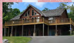
75 Highline Drive Wisp Ski Home $480,000 - Dec 2017