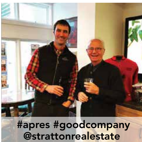
#apres #goodcompany @strattonrealestate

Follow us on Instagram @strattonrealestate