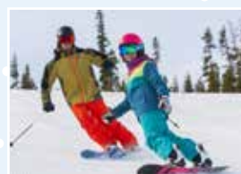
WINTER PARK RESORT Winter Park, CO A mountain of many adventures... "more than you imagine"