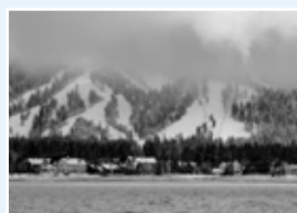
SNOW SUMMIT Big Bear Lake, CA Lift serviced hiking and mountain biking