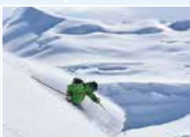
CANADIAN MOUNTAIN HOLIDAYS (CMH) Canada World's largest heli-skiing company