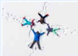
SNOWSHOE Snowshoe, WV 9000 Acres of spontaneity inspires every guest