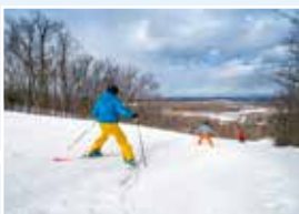
BLUE MOUNTAIN Ontario, Canada North America's widest ski mountain