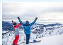
SQUAW VALLEY ALPINE MEADOWS Olympic Valley, CA Over 300 days of sunny skies every year