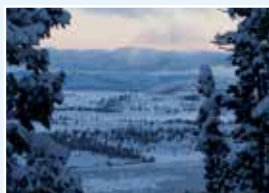
JUNE MOUNTAIN June Lake, CA California's highest mountain- world class skiing with a local feel.