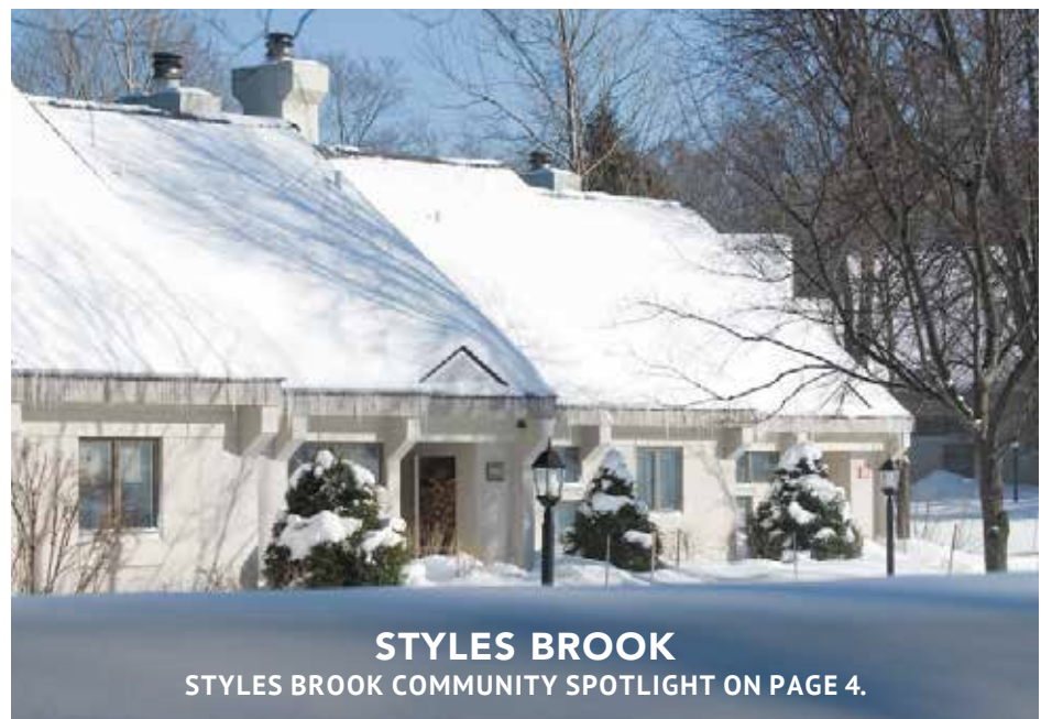
STYLES BROOK STYLES BROOK COMMUNITY SPOTLIGHT ON PAGE 4.

Follow us on Instagram @strattonrealestate