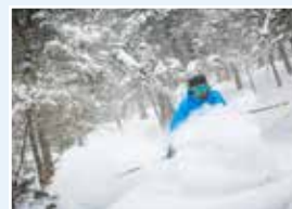
TREMBLANT Quebec, Canada Four season destination in the heart of the Laurentians