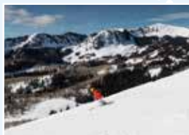
DEER VALLEY RESORT Park City, UT A commitment to excellence in everything