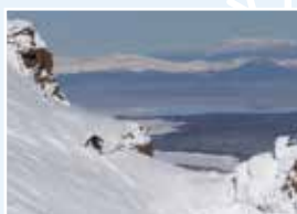
MAMMOTH Mammoth Lakes, CA California's highest four-season resort