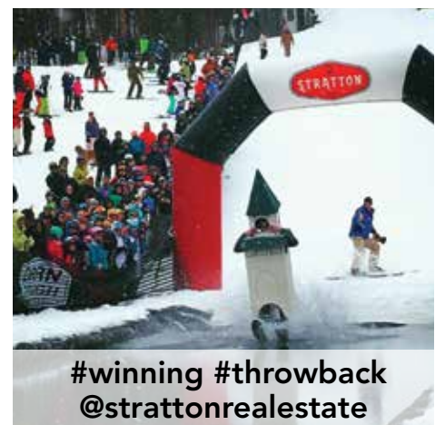
#winning #throwback @strattonrealestate