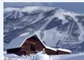
STEAMBOAT Steamboat Springs, CO 100 years of western tradition, 50 years of Olympic producing terrain