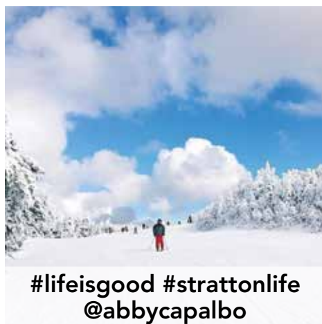
#lifeisgood #strattonlife @abbycapalbo