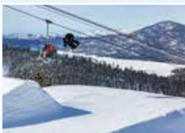
BEAR MOUNTAIN Big Bear Lake, CA The epicenter for year-round high-energy outdoor experiences