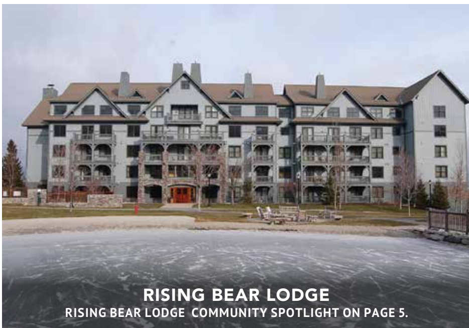
RISING BEAR LODGE RISING BEAR LODGE COMMUNITY SPOTLIGHT ON PAGE 5.