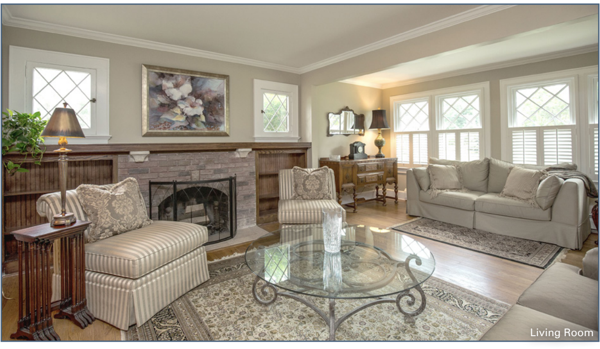
Step into this delightful home and be prepared to fall in love.