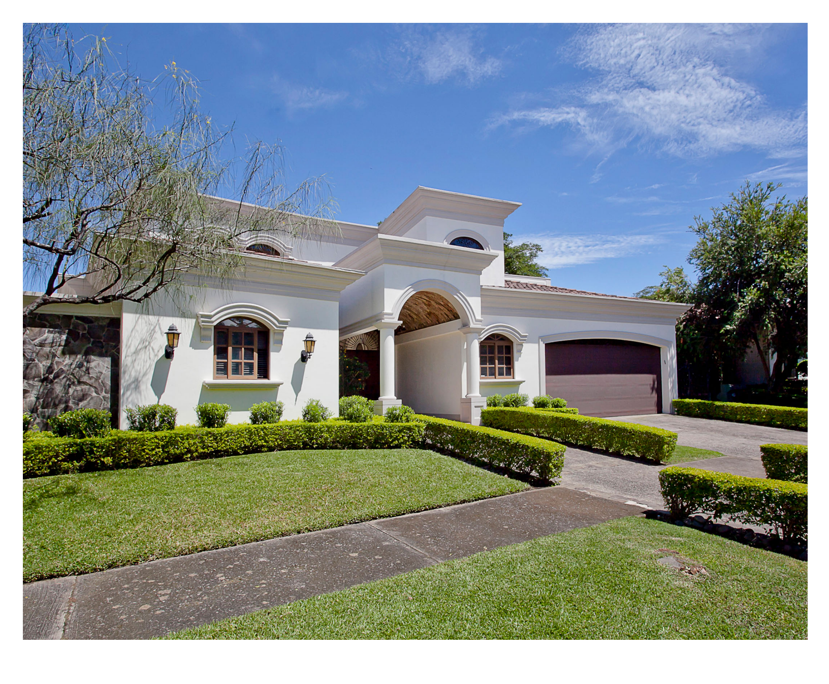
Size 6,189 sq ft